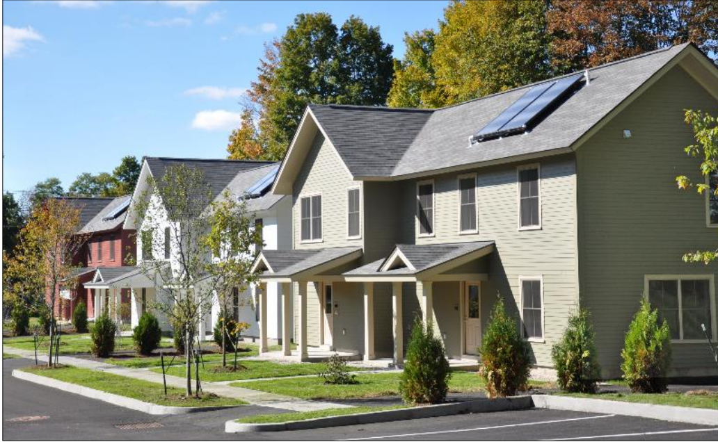
Roaring Apartments, in Bennington, created a new neighborhood with 14 affordable apartments and redeveloped another 12 apartments on Benmont Avenue