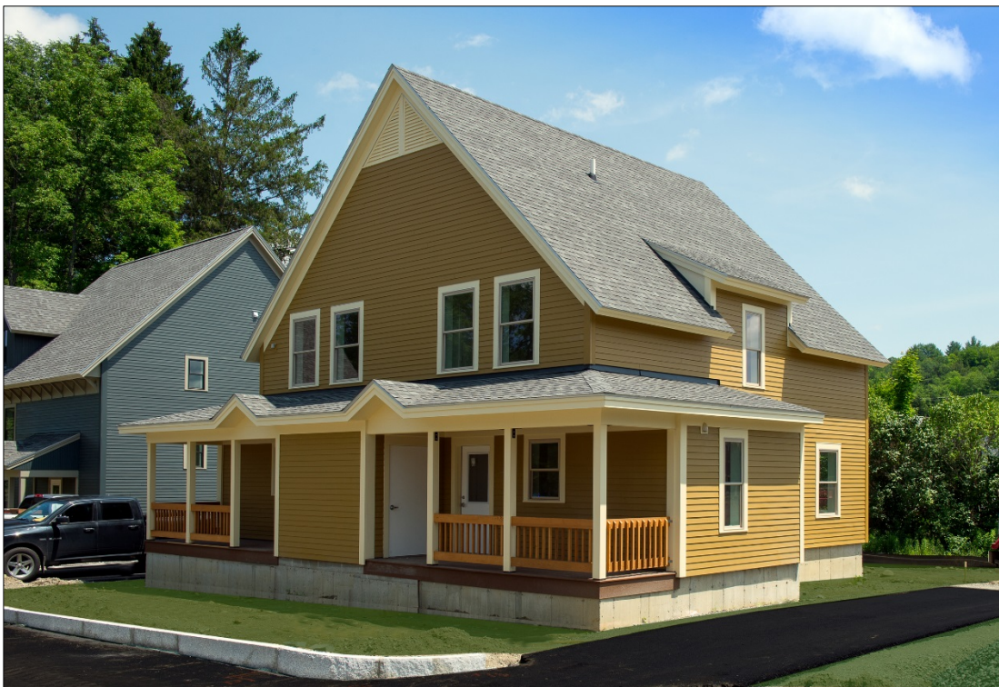
Safford Commons – Located in Woodstock, this newly constructed neighborhood created 28 multi-family affordable apartments