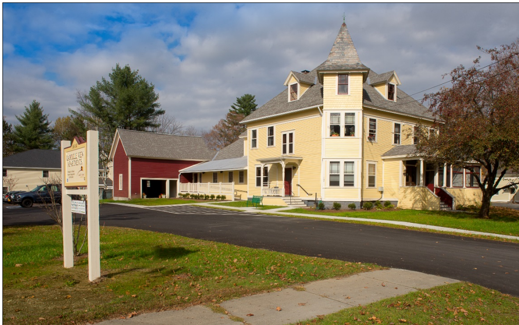
Lamoille View Apartments – 25 apartments for seniors with project-based rental assistance located in downtown Morrisville