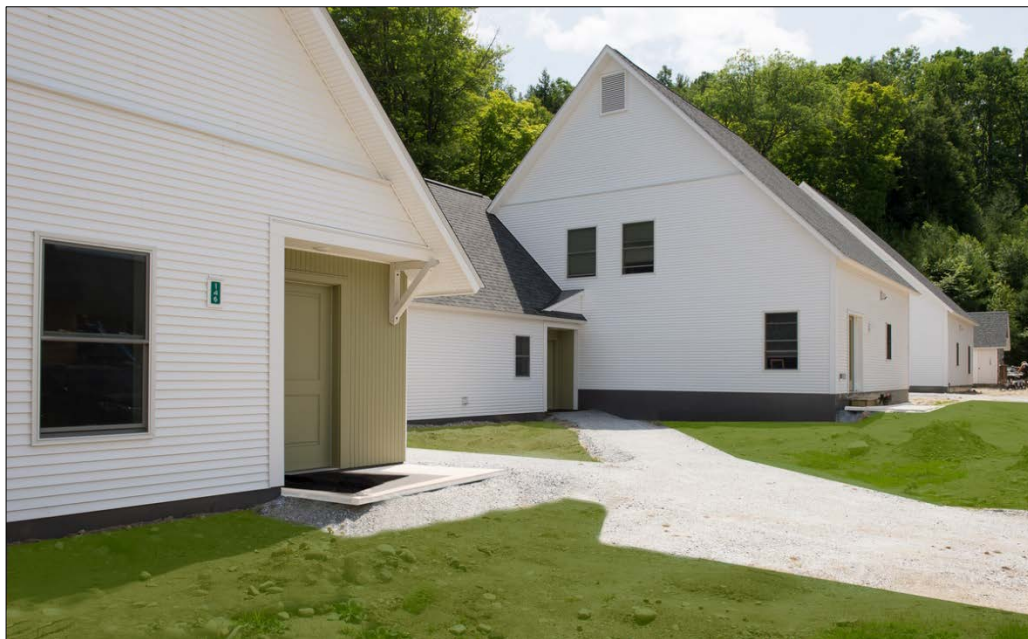
Black River Apartments – This 22-unit property in Ludlow was extensively redeveloped to provide sustainable and affordable housing