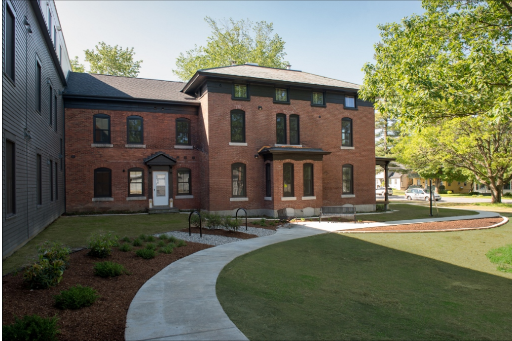
South Main Apartments – 27 apartments created through the redevelopment of Waterbury's Ladd Hall on the campus of the former State Office Complex