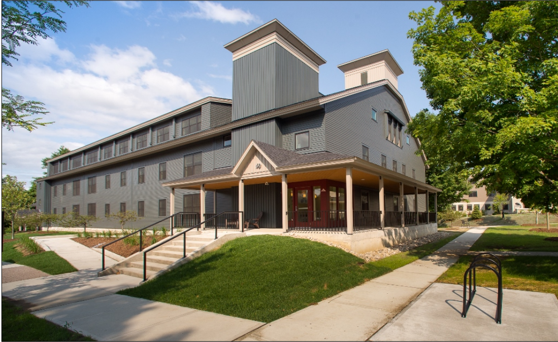
Harrington Village – 42 newly constructed apartments in Shelburne